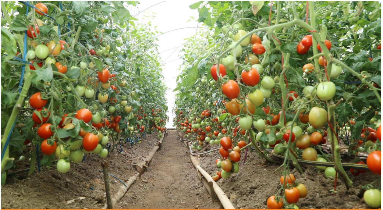
Greenhouse Tomato harvested from Serchhip for Aizawl City