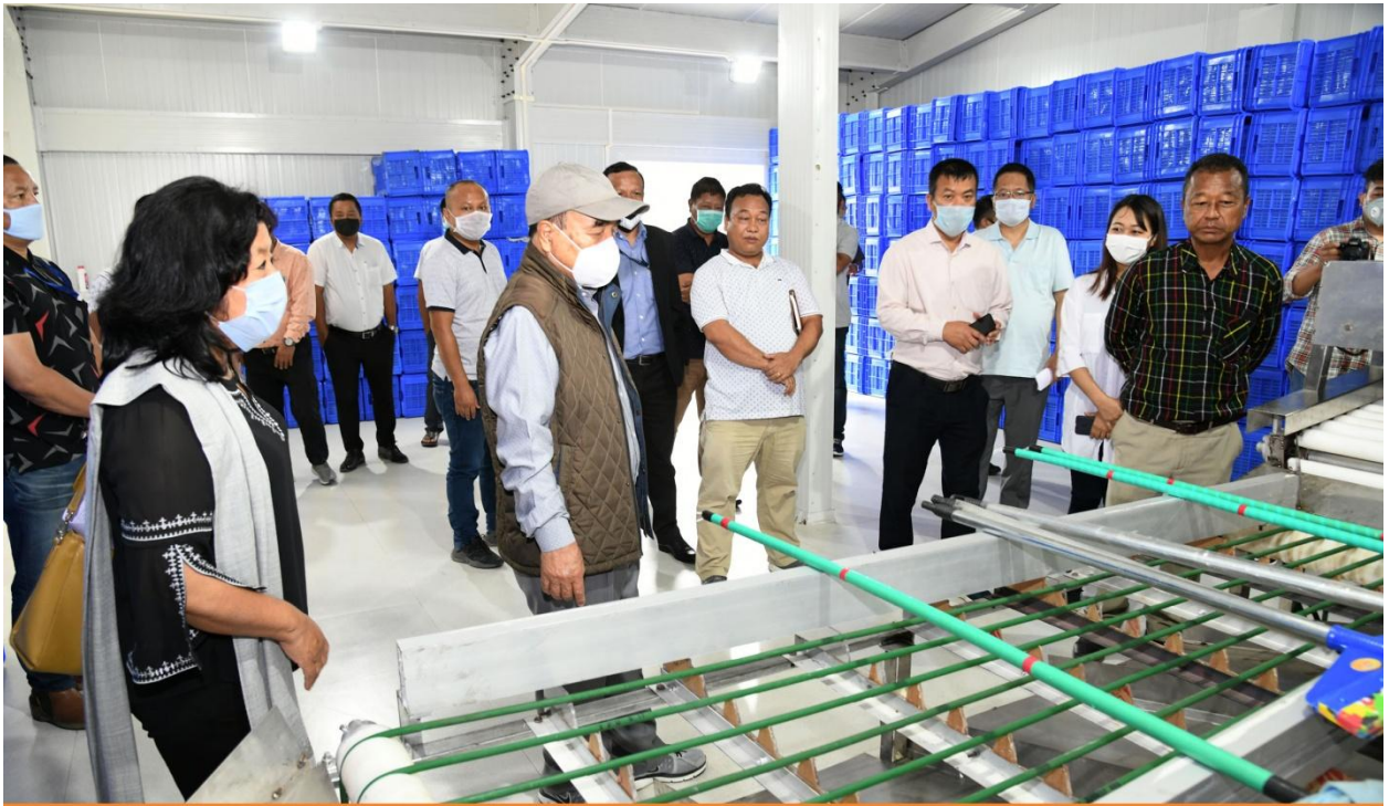
Visit of Cold Storage unit, Sairang by Pu Zoramthanga, Hon'ble Chief Minister