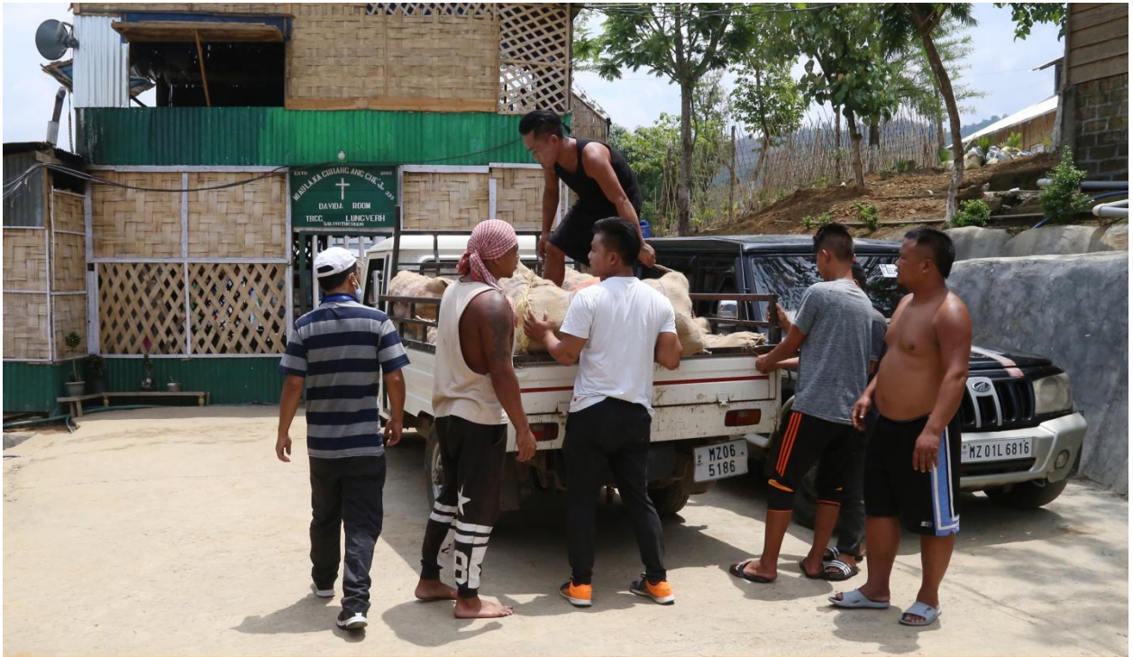
Fruits & Vegetables distributed to various Home & Centres during Covid-19 Lockdown