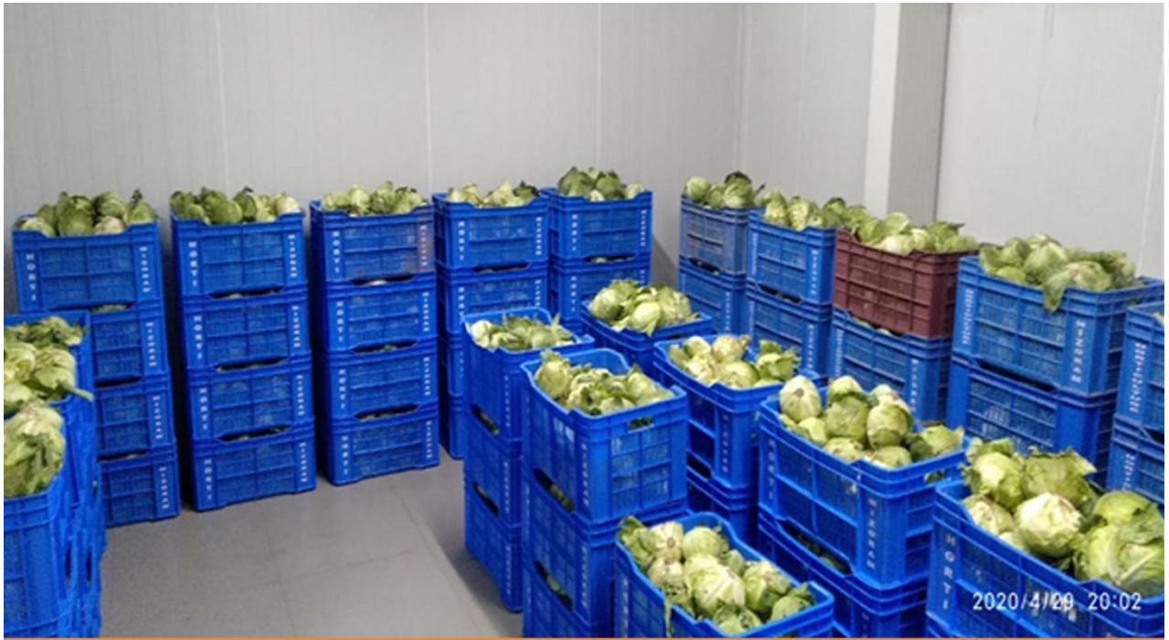
Cabbages for storing at Cold Storage unit at Sairang