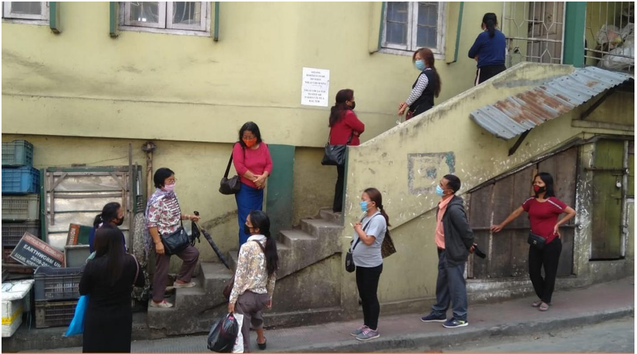
Distribution of Vegetables seed Aizawl District during Covid-19 Lockdown