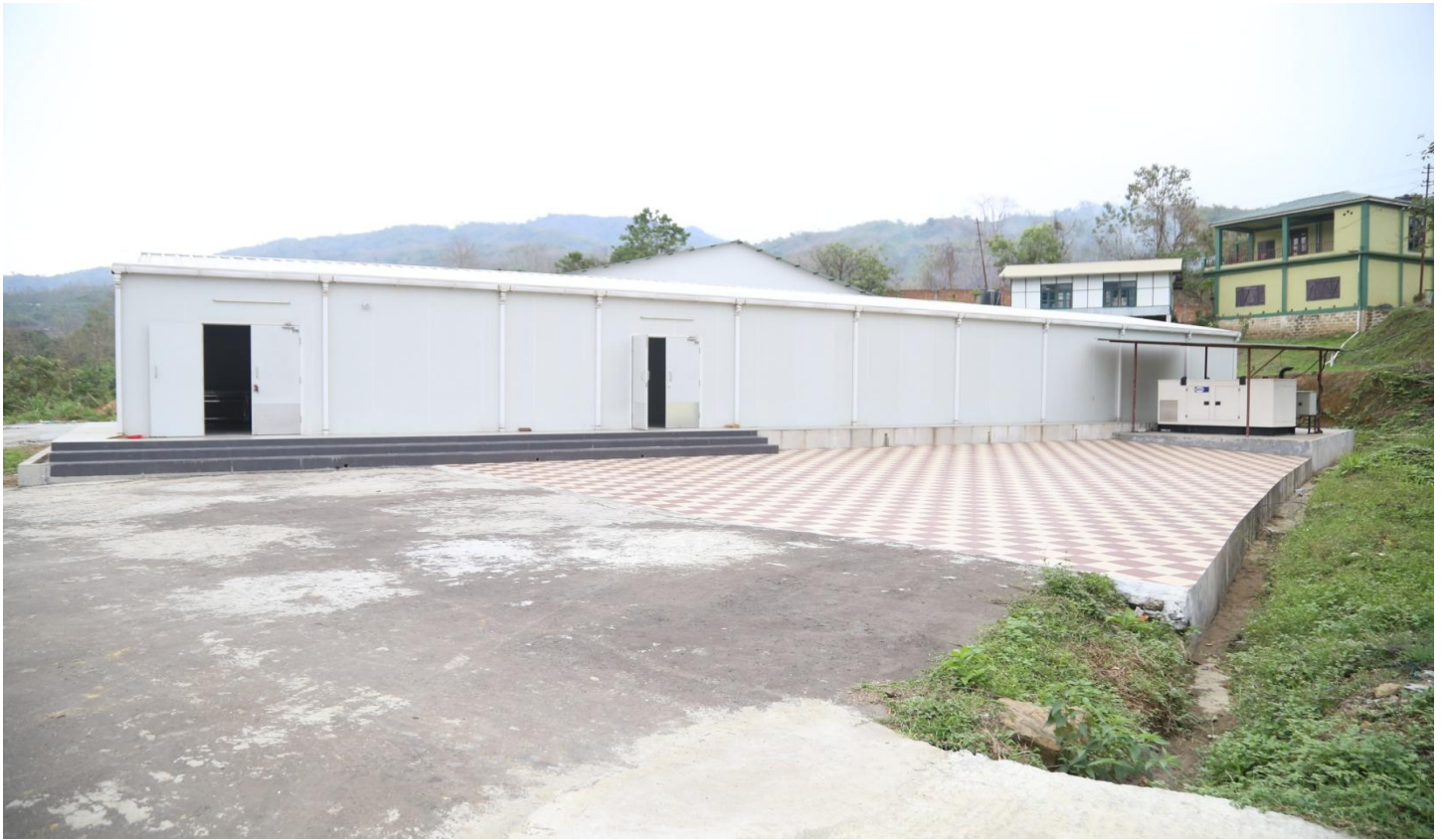
Cold Storage Unit (80 MT), Sairang