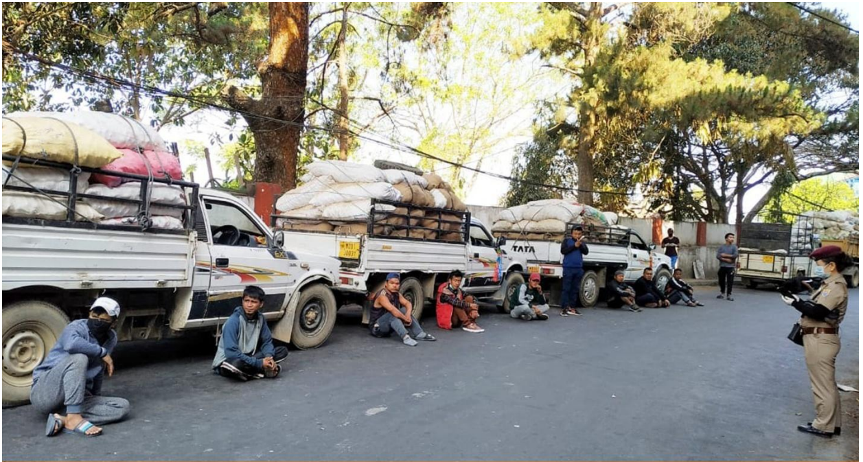
Vehicles waiting for unloading during Covid-19 Lockdown