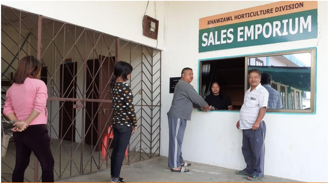
Distribution of Vegetables seed Khawzawl Division during Covid-19 Lockdown