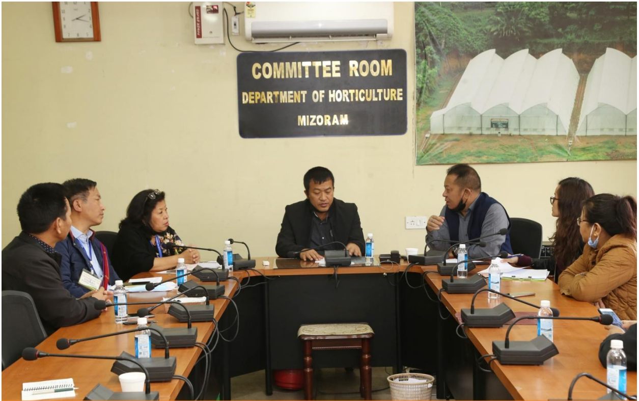
Meeting on Fruits & Vegetable supply chain during Covid-19 Lockdown