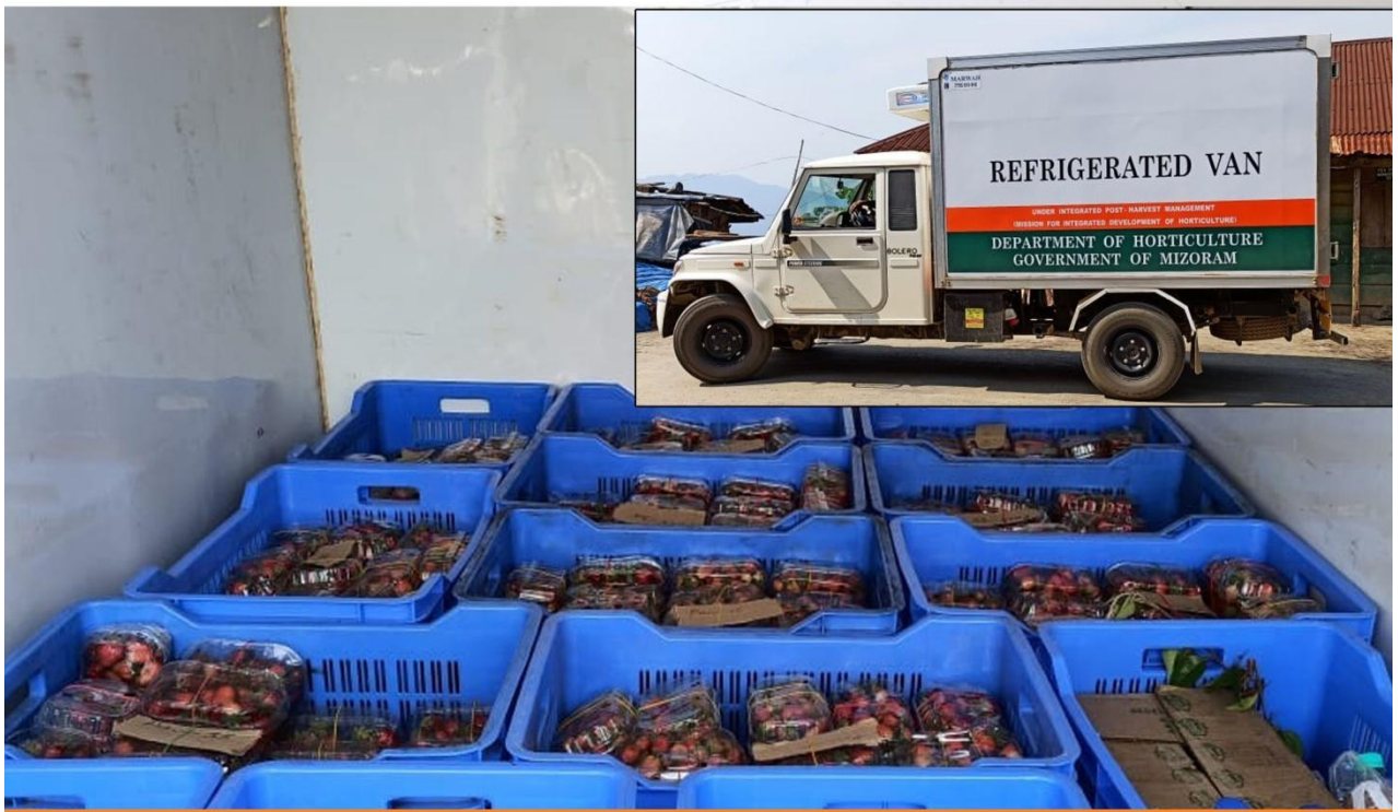
Strawberry of Siaha District carried by Refrigerated Van for Lunglei District