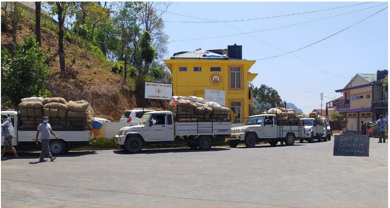
Vehicles from villages for Aizawl City