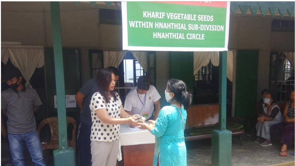
Distribution of Vegetables seed Hnahthial District during Covid-19 Lockdown