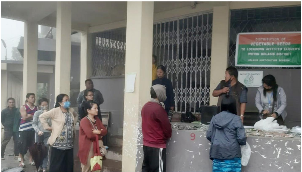
Distribution of Vegetables seed Kolasib District during Covid-19 Lockdown