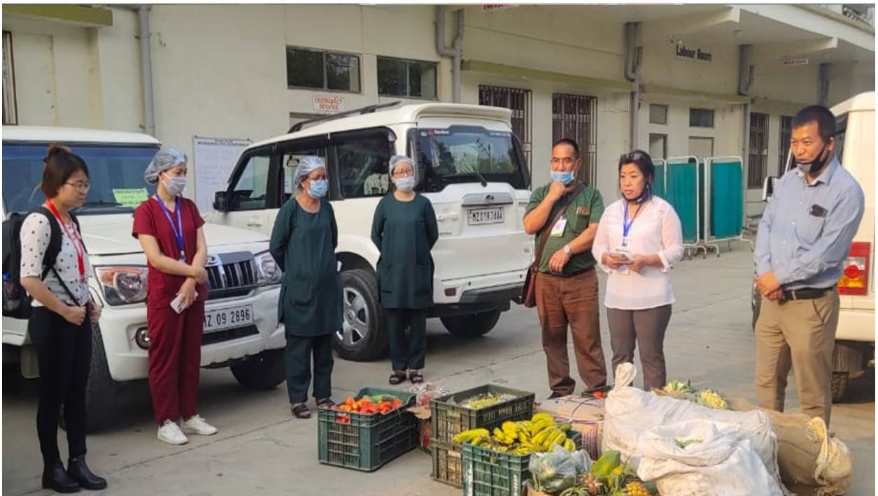
Fruits & Vegetable for Zoram Medical College, Hospital Quarantine Centre