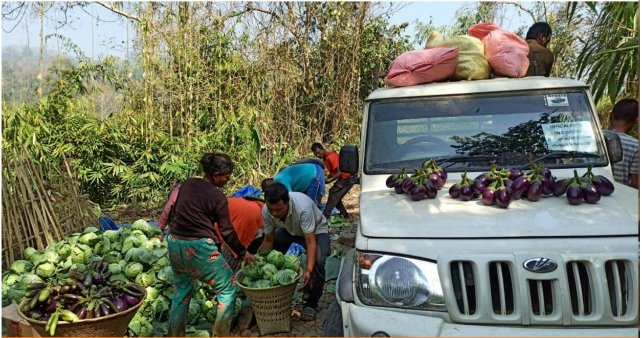
Collection of Fruits & Vegetables from farmers field during Covid-19 Lockdown